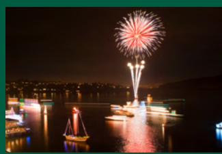
Parade of Lights See more on page 1.

Click here or scan the QR code for the English Newsletter Audio