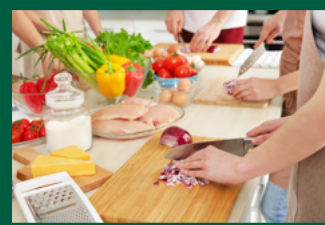
Cooking Classes See more on page 2.