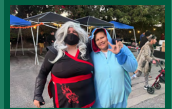
Holiday Highlights See more on page 3.